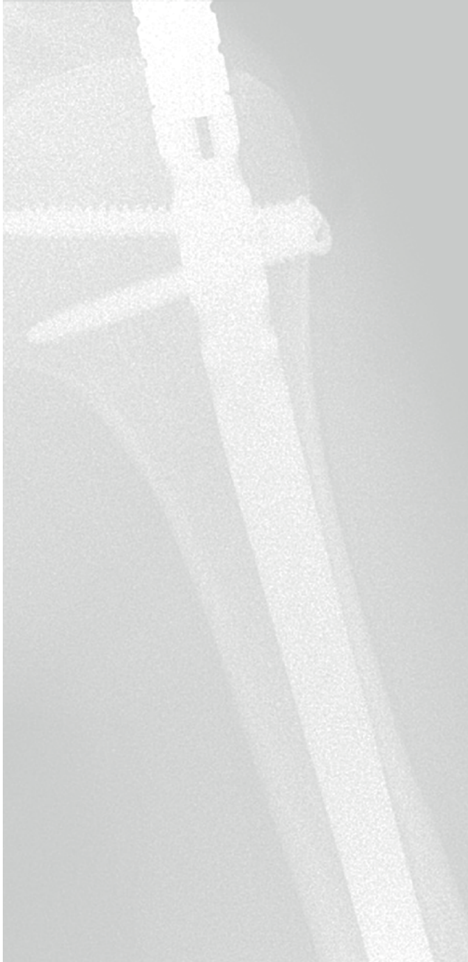
Polarus 3 Nail