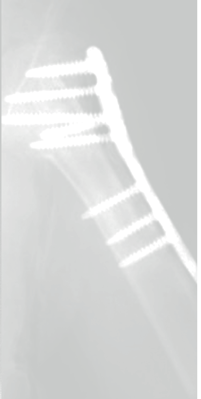
Polarus 3 Plate