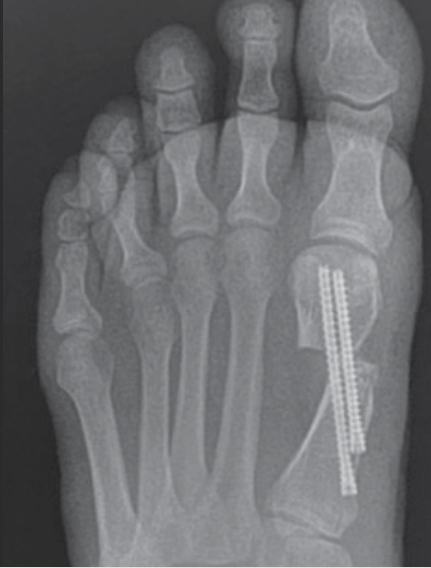
3.5 Mini- Hallux Valgus