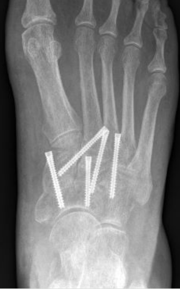
4.0 Standard – Tarsometatarsal Joint Fusion Involving Naviculocuneiform and second and third TMT joints